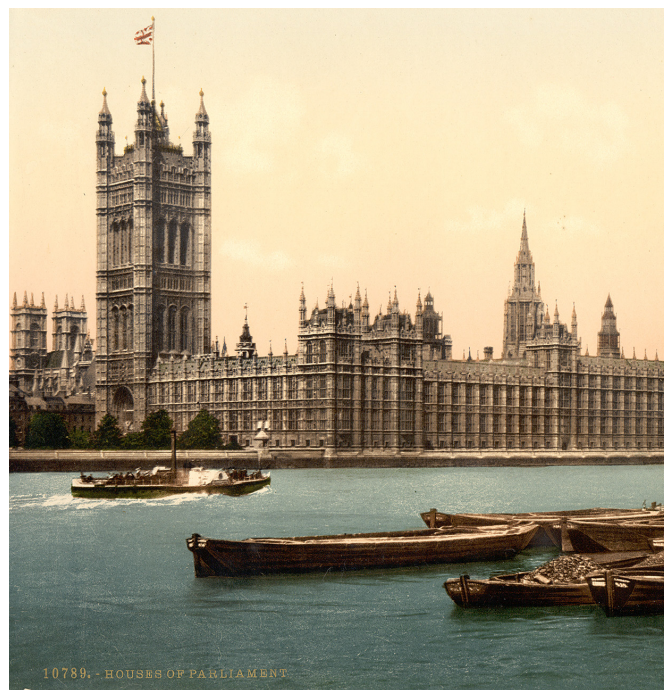
10789 - HOUSES OF PARLIAMENT

Included are individually rekeyed metadata records for every one of the more than 950,000 petitions accepted by Parliament between 1833-1918.